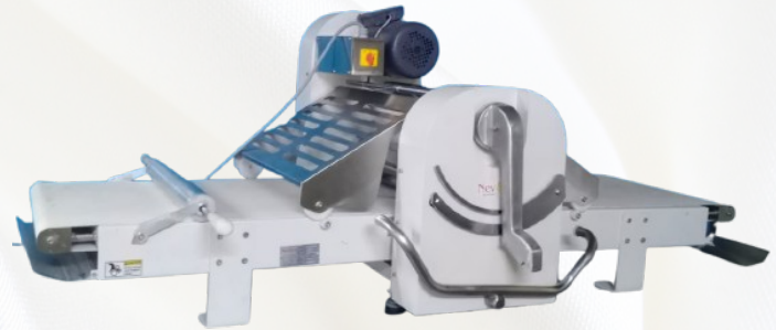
Table top Dough Sheeter